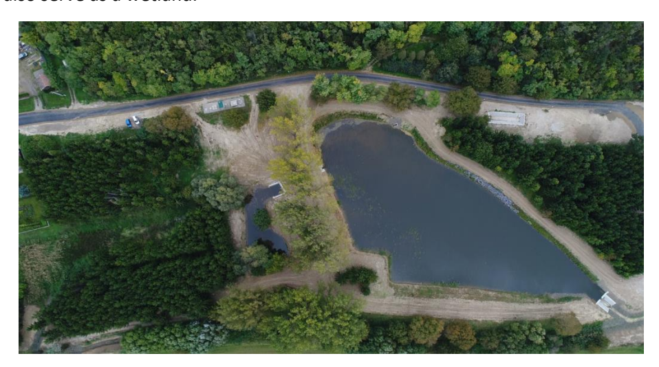
"The complex drainage and water retention system tested well during the flash flood of early June 2020 and I can say that it protected the municipality 100% from flooding." (Sándor Tordai, Mayor of Püspökszilágy)

Pilot solution: Rather than drainage, the focus is on slowing down run-off and conserving and retaining water in the landscape. On the side branch of the Szilágyi stream, seven sediment control wooden dams were constructed from local timber and four boulder bunds were also renovated. These natural barriers slow the flow of water, flatten the flood peak and prevent flooding. In addition, a lateral reservoir has been constructed at the lower catchment, which can absorb excess water and also serve as a wetland.