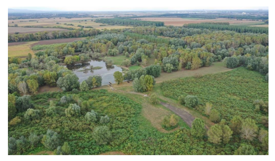
Costs (geodetic survey, design, licensing, construction): cca. 44.4 million HUF Short movie about the pilot: https://youtu.be/eOYn5FOk5rU

The aim of the project is to increase local flood safety, prevent invasive species (horseshoe crabs) from infesting the floodplain and increase the amount of water that can be retained in the landscape. The small pond system will store valuable water resources and inland water from the Tisza flooding, thus mitigating the adverse effects of climate change. The biomass from the plantation can be used to replace the use of natural gas in public buildings, which will also contribute to slowing climate change. In addition, the water buffalo and grey cattle grazing on the restored floodplain will also help to develop the local economy as a visitable ecotourism programme